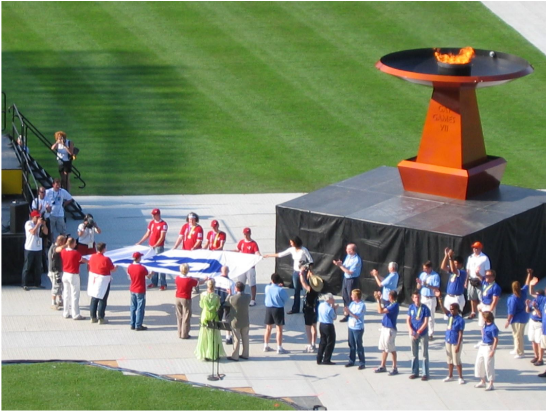
2006's Chicago Gay Games Closing Ceremony