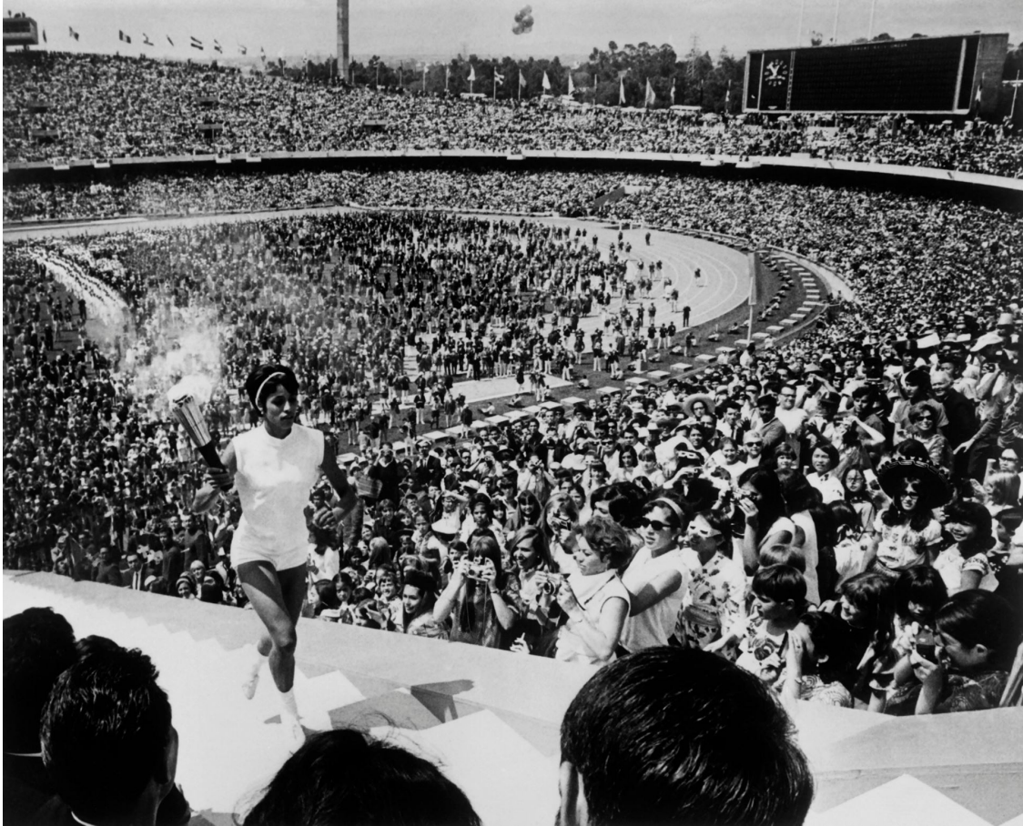
Mexico City Olympics Opening Ceremony 12 October 1968