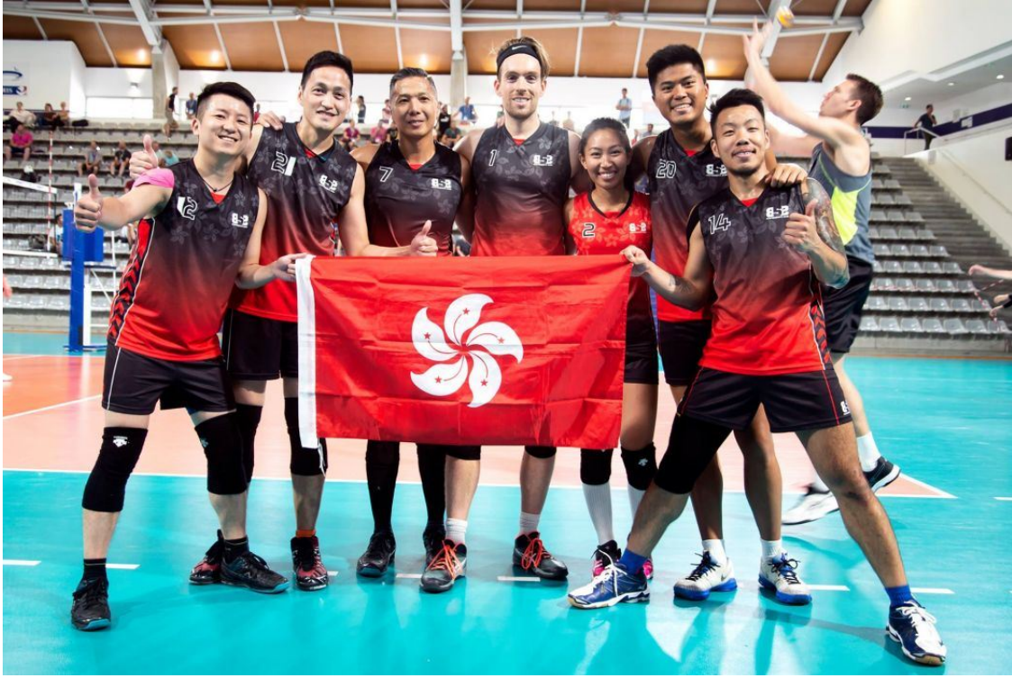
Hong Kong Mixed Volleyball team