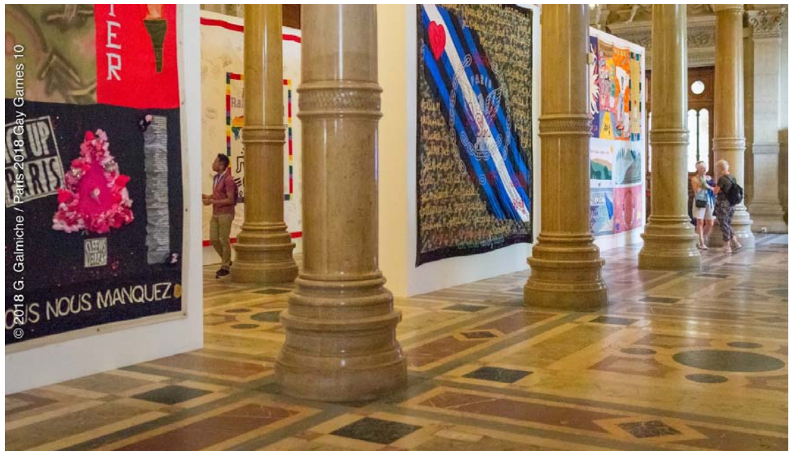
AIDS Memorial Quilt Exhibition Gay Games 10: Paris 2018

On 20 November 2019, Speaker of the House of Representatives Nancy Pelosi and other Congressional leaders joined the NAMES Project Foundation (NPF) in announcing that the National AIDS Memorial will be the new caretaker of the AIDS Memorial Quilt ("The Quilt"), returning from Atlanta to its home in the San Francisco Bay Area.